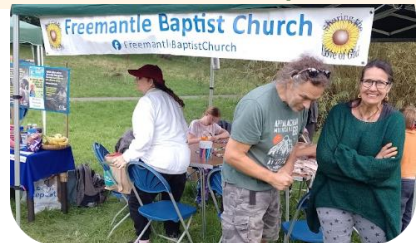
Our Fairtrade display and craft tent.