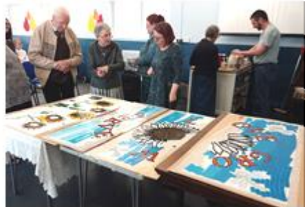
16 th June: All four sections