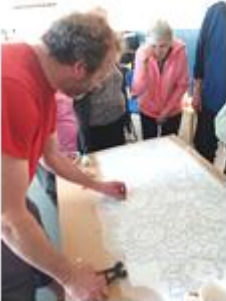
15 th May: First piece