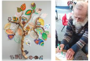
We coloured in leaves and wrote prayers for peace on the back to put up on the tree.

However, this is not so in other parts of the world, and we are very mindful that we need to reach out to those communities.