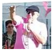
Answer on page 8