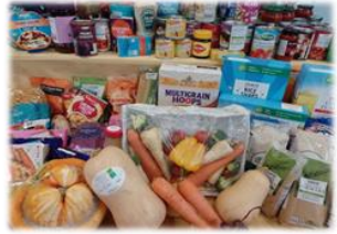
Our Harvest table laden with tins, packets, jars and fresh produce

We are indeed grateful that there is no shortage of supplies in our supermarkets.