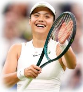
Tennis: Emma Raducanu – British No. 1