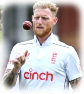
Cricket: Ben Stokes, England's captain