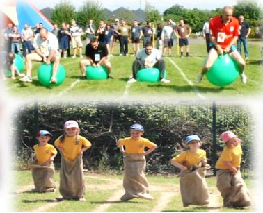
School Sports Day