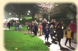
. . . towards the shelter